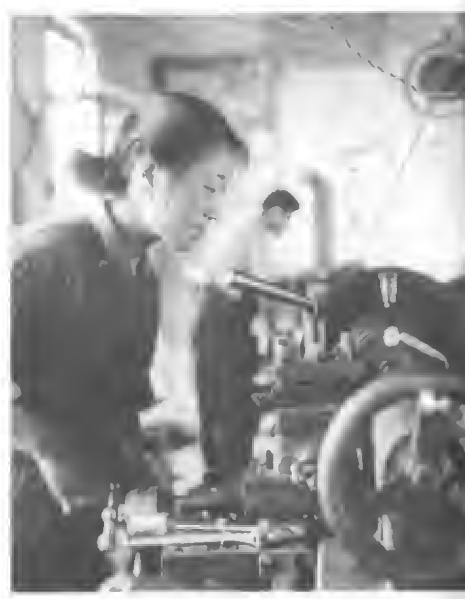
In the machine repair shop run by the commune.